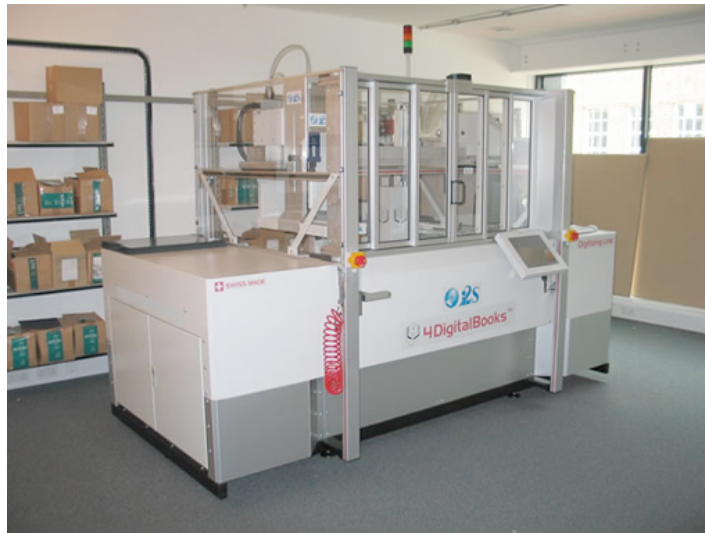
Fig. 1 University of Southampton, BOPCRIS 9

The Eighteenth Century Parliamentary Papers Project, 7 one of the initiatives funded by the Joint Information Systems Committee (JISC) digitization programme, will use very fast bulk scanning equipment that is capable of scanning 600 pages per hour, facilitated by vacuum enabled page turning technology and laser guided edge detection sensors. The size, weight and cost of this equipment (see fig.1) clearly requires a long term institutional commitment and will exceed the strategic requirements of many organisations and projects, but it is symptomatic of a new approach to resource creation that such tools now exist that can process around one million scanned pages a year, using techniques that are sensitive to the fragile nature of the primary sources and mindful of the technical standards intrinsic to sustainable resource creation. At a recent Methods Network workshop, 8 one participant reported that the Open Content Alliance is using this kind of hardware in a multiple-machine facility that perhaps begins to approach the sort of capabilities available to commercial entities such as Google and Microsoft, who are separately in the process of creating colossal digital repositories of books numbering millions of items.