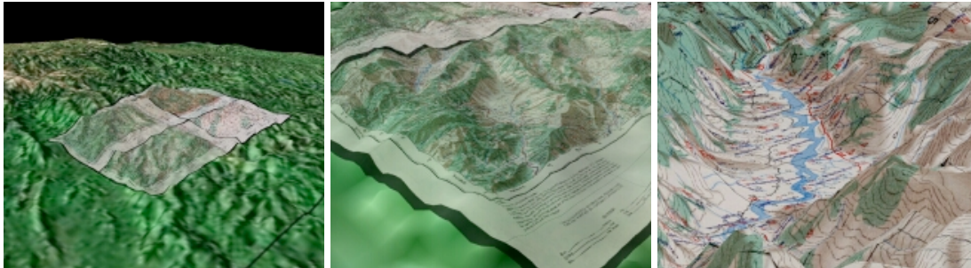
Fig. 5 Maps from the CHGIS

A similar initiative, also launched in 2001 is the China Historical GIS, hosted at Harvard, which features historical maps and datasets that are freely available for academic use. (See Fig. 5)